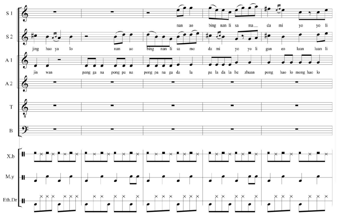
Figure 2. Example 2

The success of this work, like most of Liu's works,