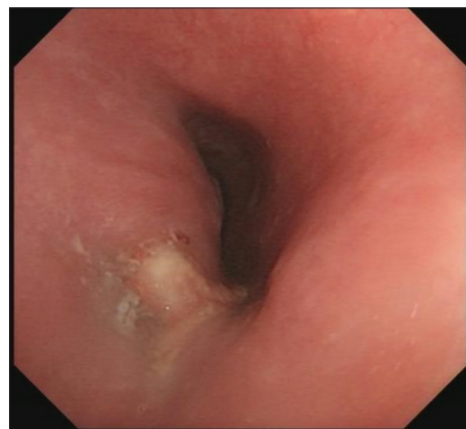
Figure 2. Endoscopic examination after 2 months of treatment with anti-tuberculosis drugs. The image shows diminished swelling lesion and visible, new granulation tissue.

During hospitalization, the patient's symptoms improved after anti-infection treatment. After discharge, the patient was treated regularly for 2 months with anti-TB drugs, comprising of rifampicin, isoniazid, ethambutol, and pyrazinamide. The symptoms of swallowing discomfort disappeared. Reexamination using the endoscope showed that the swelling lesion had diminished ( Figure 2 ). As of